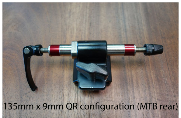
135mm x 9mm QR configuration (MTB rear)