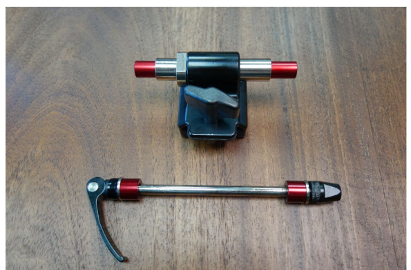
142mm x 12mm configuration (MTB rear)

Note: For 20mm thru-axes, additional thread in adapter #16687 is required.