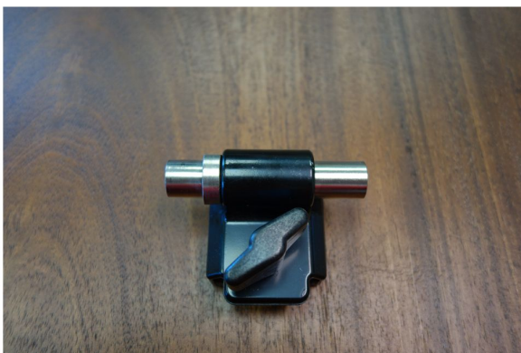
100mm x 15mm configuration (MTB front)